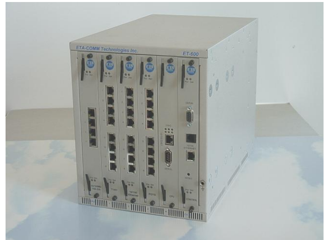
6-slot, Up to 32 ports