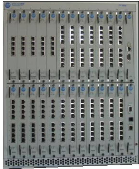
26 Slot, up to 192 Ports

The ET-2600 is designated to be accessed by multiple users and will mediate between these users using a lightweight access control mechanisms that is designated user friendly. Although an individual user's resources will be monitored for activity and may be returned to the pool if that user is inactive for an extended period, there is also a safeguard "back door" that allows specified users to control the entire switch so that unused resources can be freed.